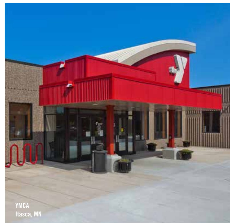
YMCA Itasca, MN