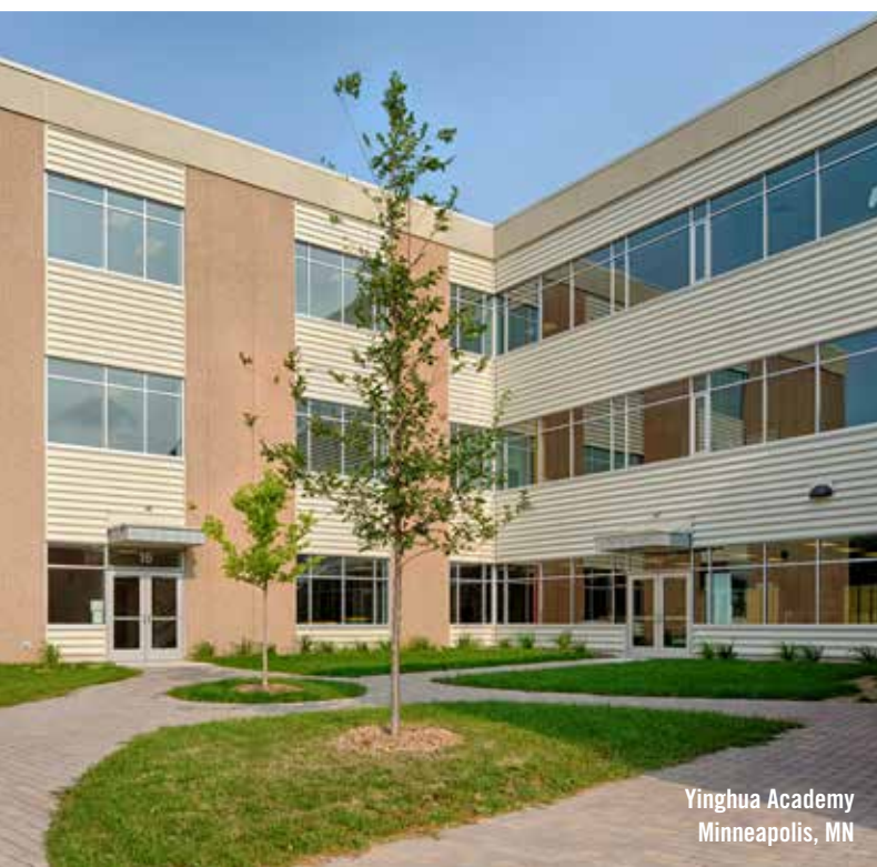
Yinghua Academy Minneapolis, MN