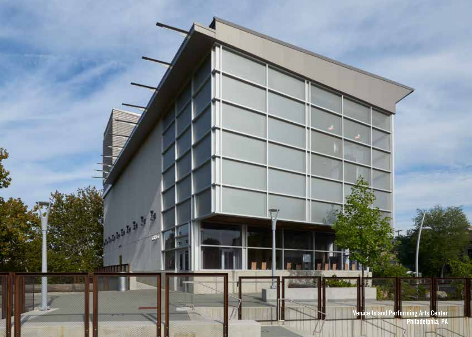
Venice Island Performing Arts Center Philadelphia, PA

Fabcon's experience working with organizations while they design the most energy-efficient, maintenance-free, and fiscally-viable buildings has resulted in many successes. And while we are proud of our products and construction efficiencies, we are most proud to be recognized as a service-oriented partner who is looked upon as a supplier who cares about those who will use the building.