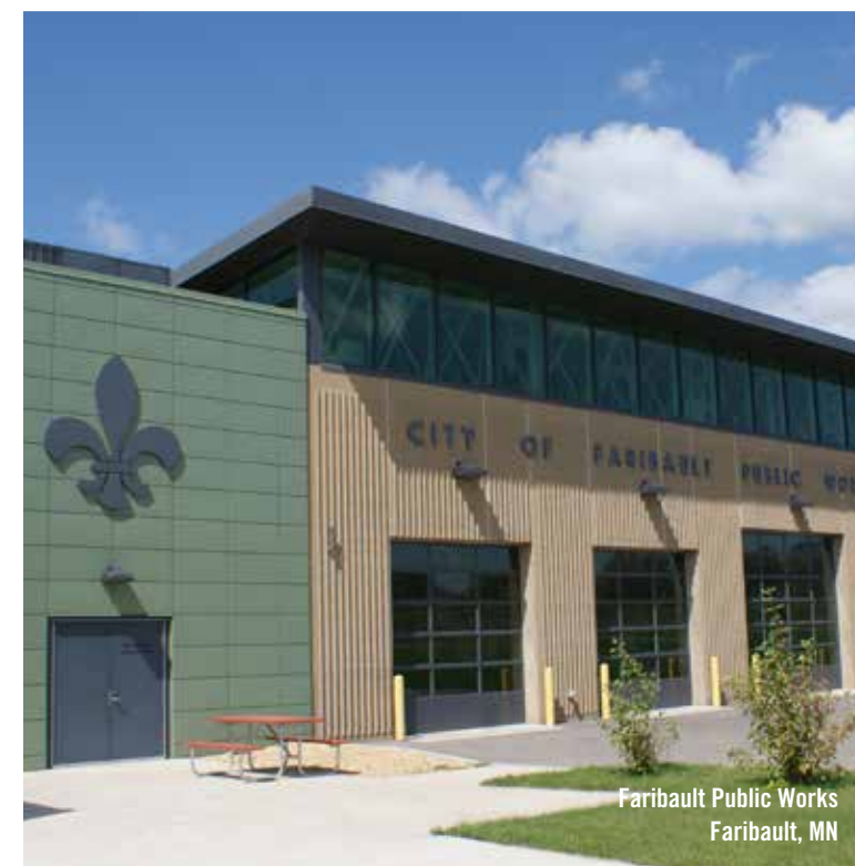
Faribault Public Works Faribault, MN